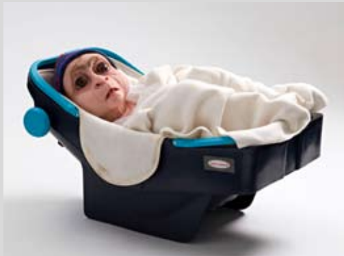
'Foundling', by Patricia Piccinini

Craig Venter, the man who sequenced the human genome says we are "on the verge of creating synthetic life." He compares the building of an organism to building computer systems.